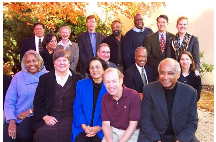
TEAM Westport gathers at Town Hall

The best way to find out about Westport is to spend time here.